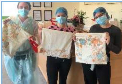
Grateful recipients of our bags at a local care home.