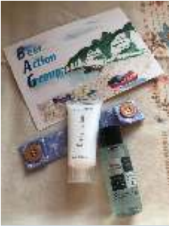
Some of the items we are putting into the care bag for frontline workers...