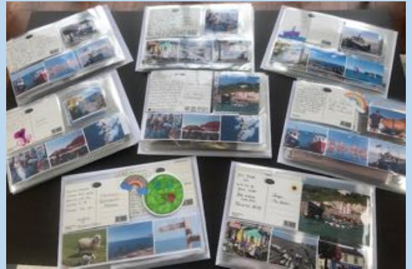
Postcards from Beer to local care home residents.