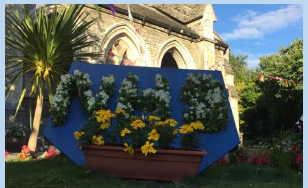
A beautiful display outside the church!