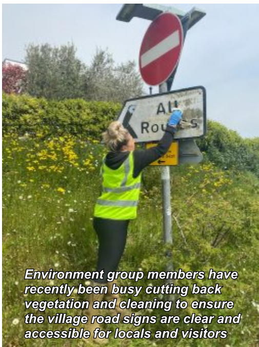
Environment group members have recently been busy cutting back vegetation and cleaning to ensure the village road signs are clear and accessible for locals and visitors

Environment Group – With Covid-19 restrictions now relaxing the environment group is looking to revive the volunteer group where local residents volunteer to assist with small jobs around the village, for example, the annual Brook clearing. Anyone who would be willing to lend a hand or two would be very welcome, please contact clerk.beerparishcouncil@googlemail.com if you can help at all.