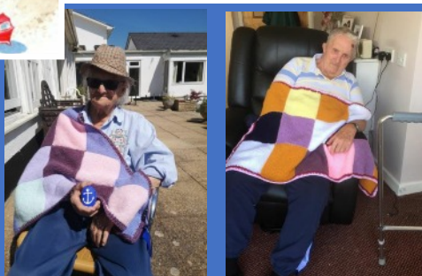
Beautiful examples of Beer knitted shawls made by local people for local people