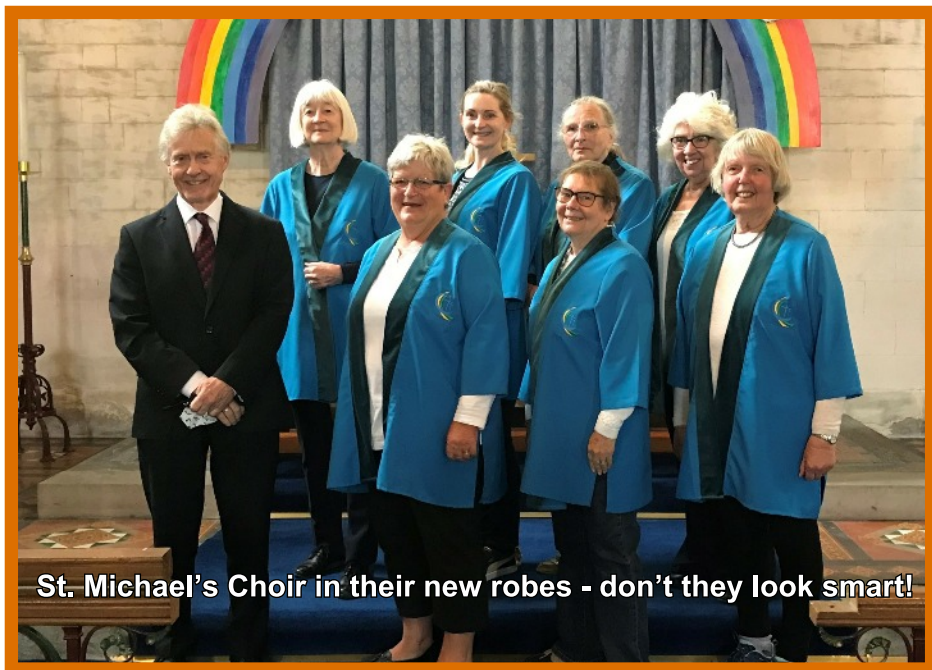
St. Michael's Choir in their new robes - don't they look smart!