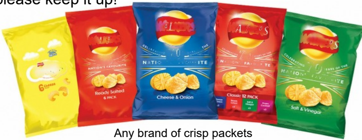
Any brand of crisp packets and crisp multipack outer packaging

Thank you for your support, we have a very successful system so please keep it up!